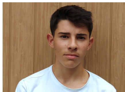
Jack: It's nice because we can go out at lunch.