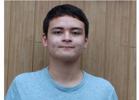
Ciaran: My favorite part is that TIPS is in Japan.