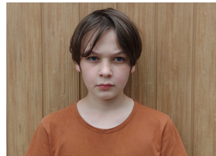
Archie: Coding, math, and science.